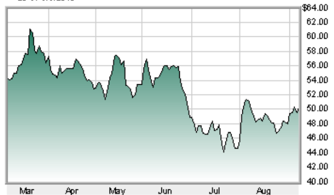
EMERGENCY MEDICAL SVCS CORP as of 9/8/2010